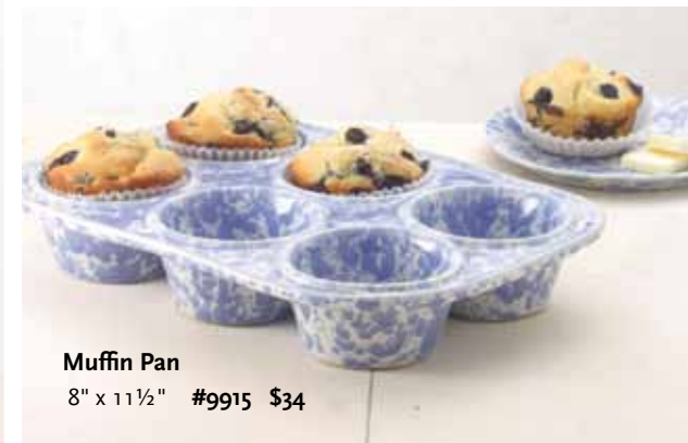
Muffin Pan 8" x 11½" #9915 $34