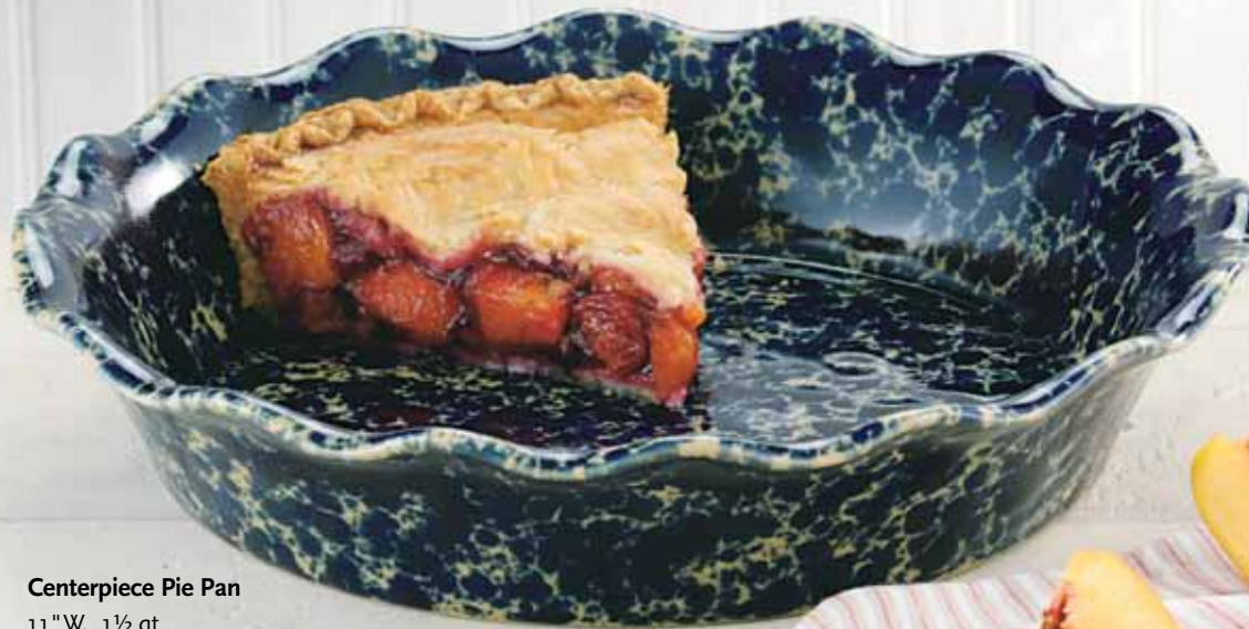
Centerpiece Pie Pan 11"W, 1½ qt #1850 $44