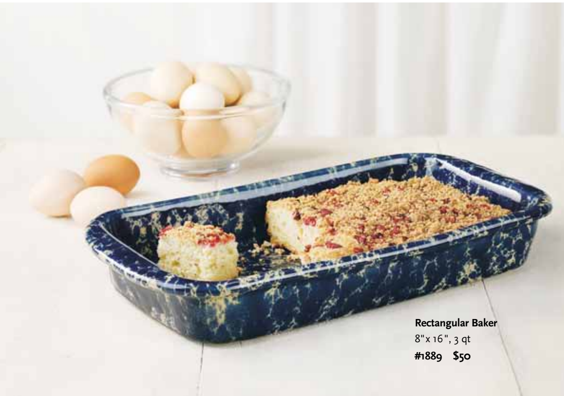
Rectangular Baker 8" x 16", 3 qt #1889 $50

We hear it again and again: the pleasure of cooking with Bennington begins when you pick up the pot. So handsome, so durable, so practical, this pottery bakes up evenly, cleans up easily, goes to table proudly.