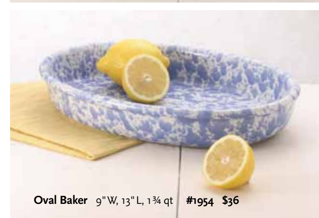
Oval Baker 9"W, 13" L, 1¾ qt #1954 $36