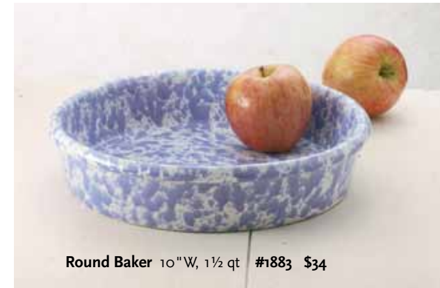
Round Baker 10"W, 1½ qt #1883 $34