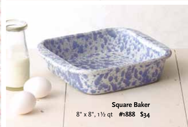
Square Baker 8" x 8", 1½ qt #1888 $34